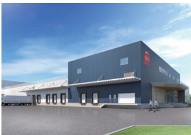
New Donan Plant to open in 2024

Beef and pork are processed by a nationwide network of seven facilities—the Doto, Donan, Aomori, Tsugaru, Shikoku, Kawatana, and Isahaya Plants. The facilities in Hokkaido account for around 50% of beef production and 30% of pork production.