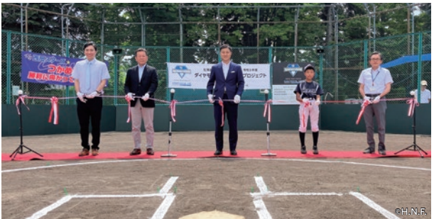
Since 2019, donations from the Fighters’ Fund have been used to repair and improve youth baseball grounds through the Diamond Brush Project.

The corporate philosophy of the Hokkaido Nippon-Ham Fighters calls for the creation of a sport community (SC) through the utilization of resources and expertise relating not only to sporting environments, but also to community life and regional environments, to support the development of the next generation and build a healthy society. In 2009, we established the Fighters’ Fund to support activities relating to sport, the natural environment, and communities. Income for the fund consists of a share of proceeds from sales of tickets and goods, as well as money raised through charity auctions.