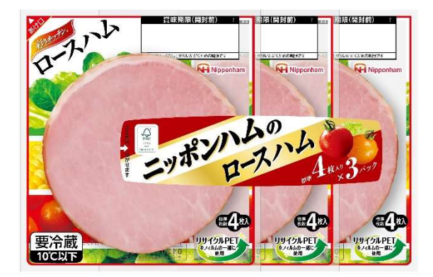
Irodori Kitchen loin ham

[Consumer products] Ham and bacon 18items