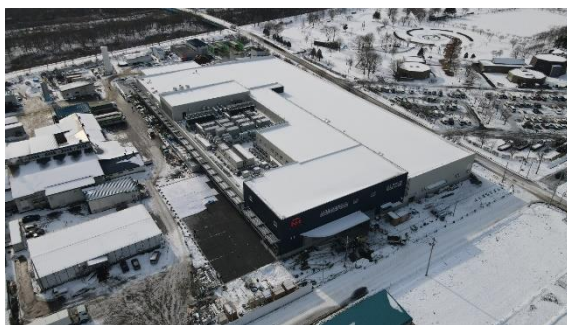
A panoramic view of the Donan plant

We are delighted with the completion of Nippon Food Packer's new Donan Plant. Nippon Food Packer has contributed greatly to the development of our town's economy over the nearly 50 years since 1975 when it began operations producing healthy and safe food with its packing and processing operations. We sincerely hope you will continue producing safe, secure, and high-value-added products as a leading company deeply rooted in our community.