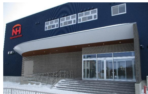
The front entrance